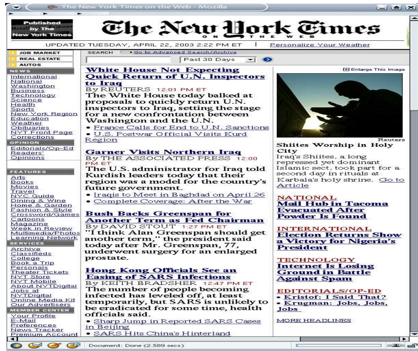
Fig. 1. New York Times Front Page

documents are designed primarily for human consumption and hence, unlike annotated Semantic Web documents, are not machine understandable.