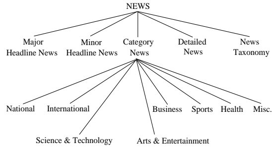
Fig. 4. An Ontology for the News Domain

Concept Association. Concept association maps a partition to a semantic concept that succinctly summarizes the meaning of its content. The concept becomes the label of the partition. To make concept association we leverage domain knowledge encoded in an ontology . Informally an ontology describes concepts and their relationships, their features and attributes in a domain of interest. For instance, an ontology for the news domain is shown in Figure 4 and Table 1. Note that all the concepts and their subsumption hierarchy is depicted in Figure 4.